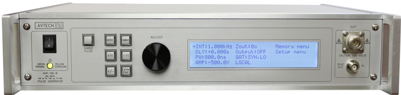
Typical Front Panel