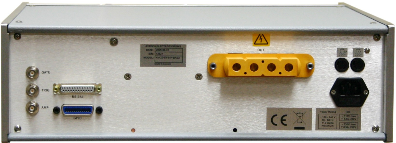
AVOZ-E4-B Rear Panel