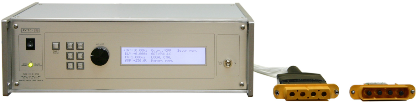
AVOZ-E4-B, with AV-HLZ2-100 output cable and mating AV-HLZA2 Adapter / Test Load