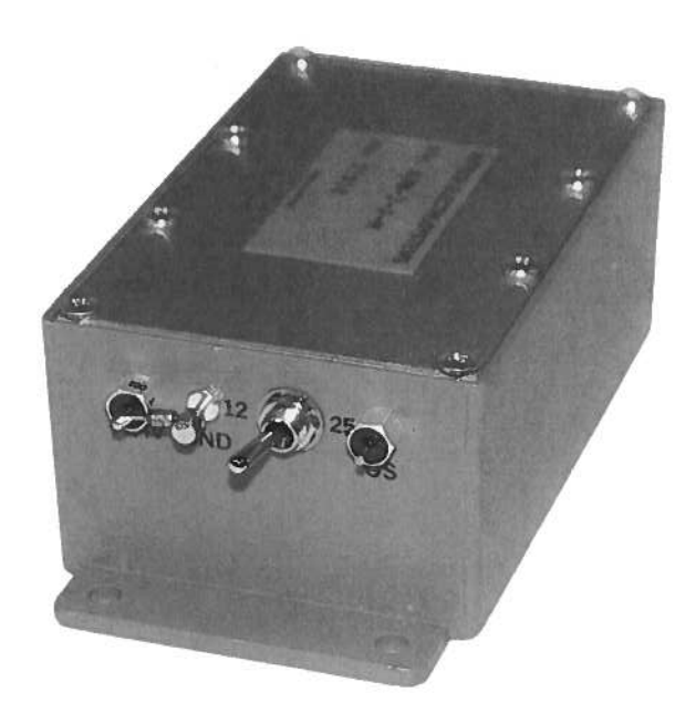
The "12/25" switch should be set in the "12" position if the PRF is less than 12 MHz. For higher PRF the switch should normally be in the "25" position for optimal rise times and pulse widths.

The location of the power terminals, the "12/25" switch, offset input are shown in the photo below.