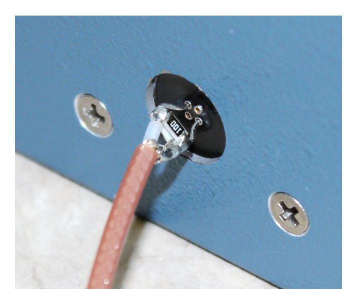
Pulse source: AVO-9RA-B-P0D-P-MS1A, S/N 13579.

Test method: Short leads are soldered across two 10\Omega chip resistors in parallel. A coaxial cable is soldered across the resistor. The signal lead is inserted into the anode pin socket. The ground lead is inserted into one of the other pin sockets (which are grounded). The total effective resistor is 5 \Omega \parallel 50 \Omega (R_{SCOPE}) = 4.5 \Omega .