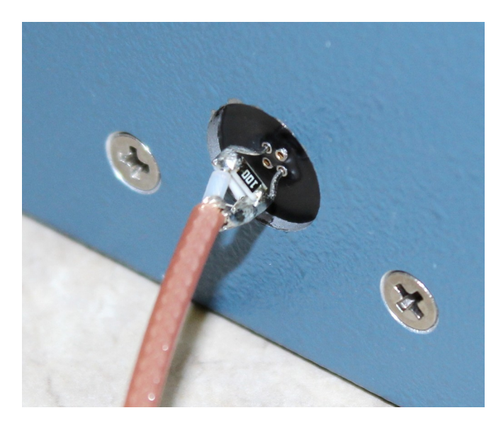
Pulse source: AVO-9RA-B-P0D-P-MS1A, S/N 13579.

Test method: Short leads are soldered across two 10\Omega chip resistors in parallel. A coaxial cable is soldered across the resistor. The signal lead is inserted into the anode pin socket. The ground lead is inserted into one of the other pin sockets (which are grounded). The total effective resistor is 5 Ω || 50 Ω ( R_{SCOPE} ) = 4.5 Ω.