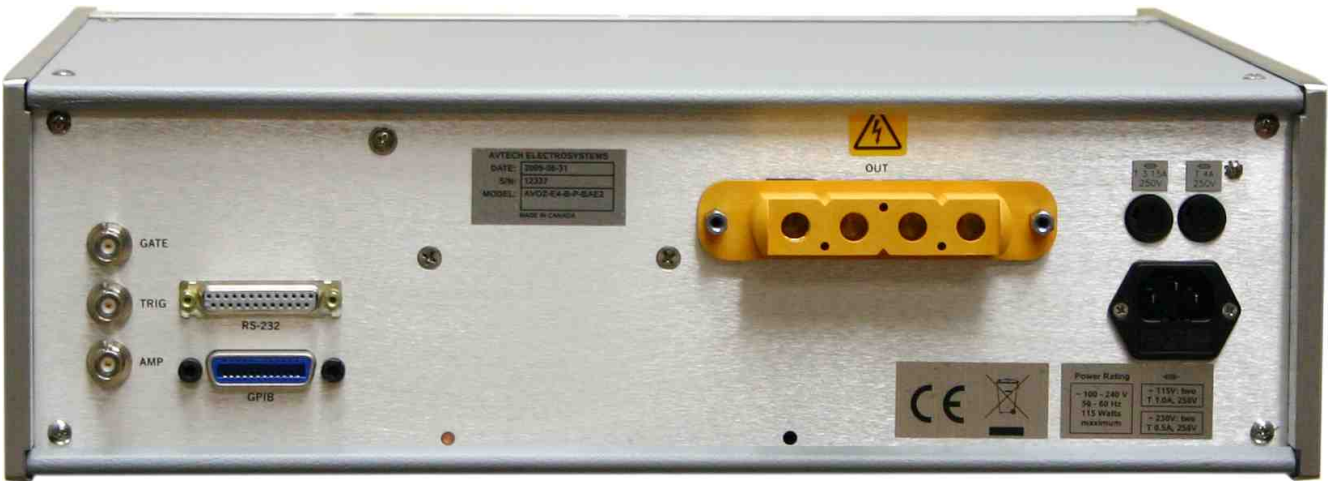
AVOZ-E4-B Rear Panel