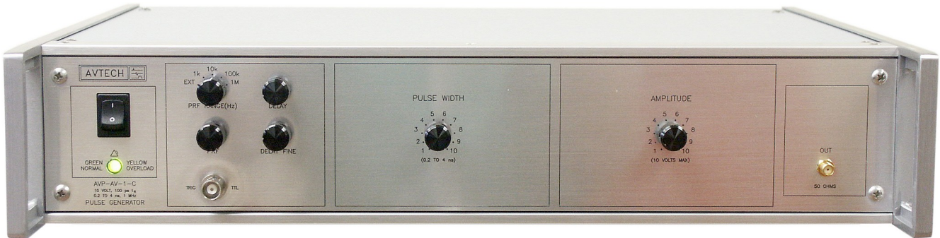
Typical -C unit (no computer control ports)