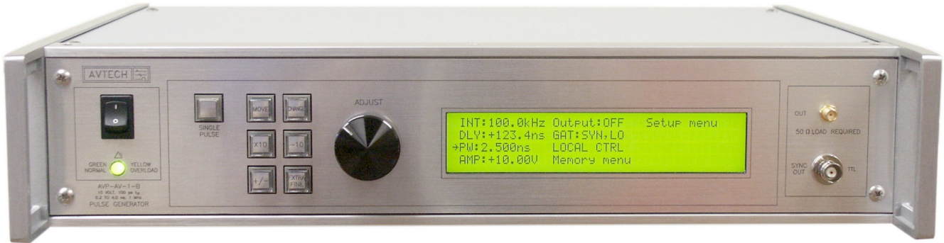
Typical -B unit (computer control ports are on the rear panel)